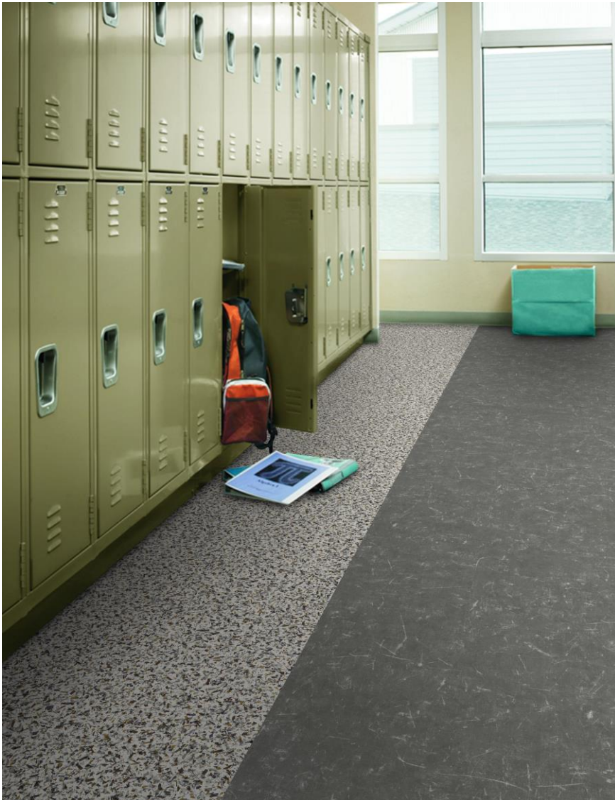
4.5 MM LVT Luxury Vinyl Tile