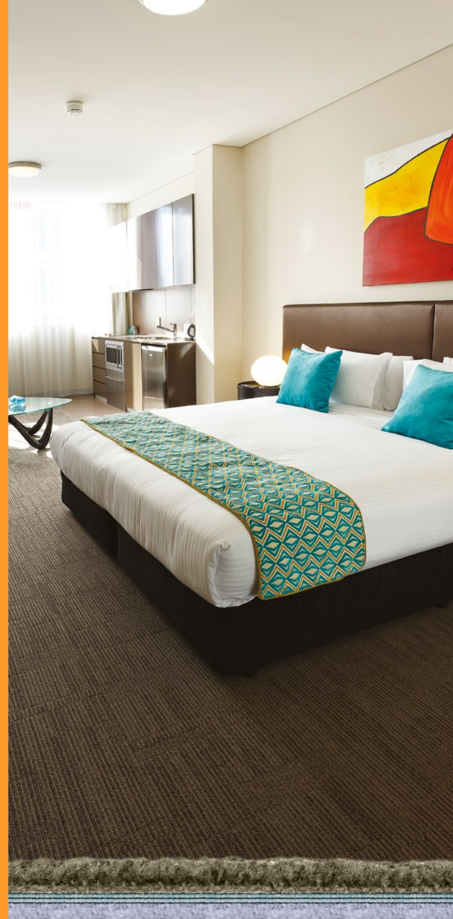
CushionBacRE™ | From left to right: Collection: Human Nature | Product: HN810 | Colour: Slate, Flint | Installed: Ashlar Collection: Near & Far | Product: NF400 | Colour: Hemp | Product: NF401 | Colour: Hemp | Installed: Ashlar Collection: Equilibrium II | Colour: Custom | Installed: Ashlar

NEW CushionBacRE™ CARRIES A 15 YEAR WARRANTY SO YOU CAN BE COMPLETELY CONFIDENT IN ALL FUTURE APPLICATION EVEN UNDER CASTER CHAIRS.