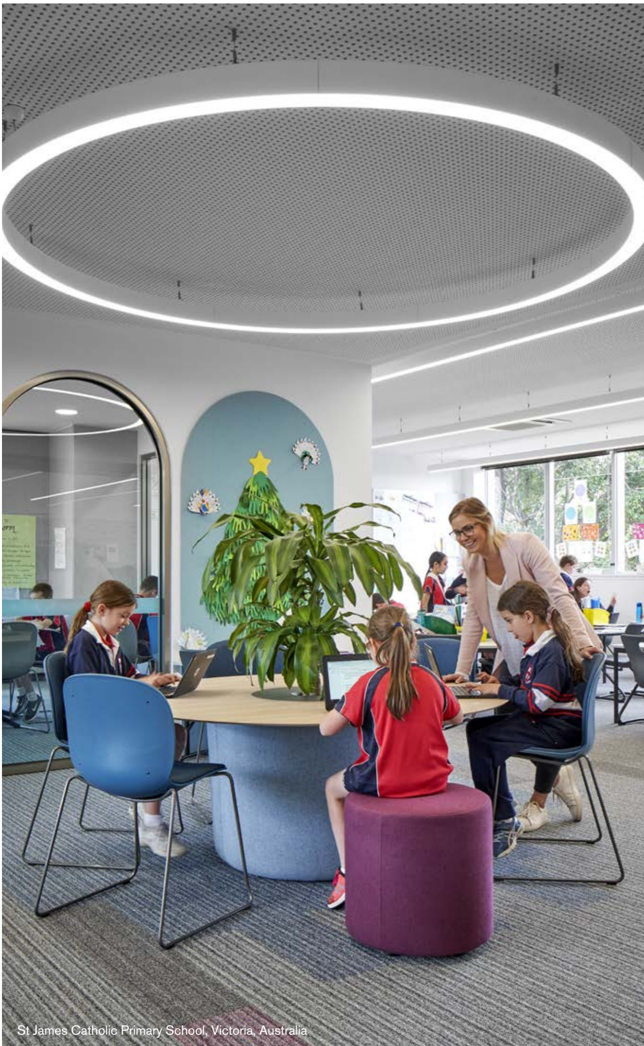
St James Catholic Primary School, Victoria, Australia

Everyone has an innate desire to see and feel this connection. It's called biophilia. And design that embraces biophilic principles – by bringing the outside inside – is probably one of the most powerful ways of enhancing a sense of well-being in learning environments.