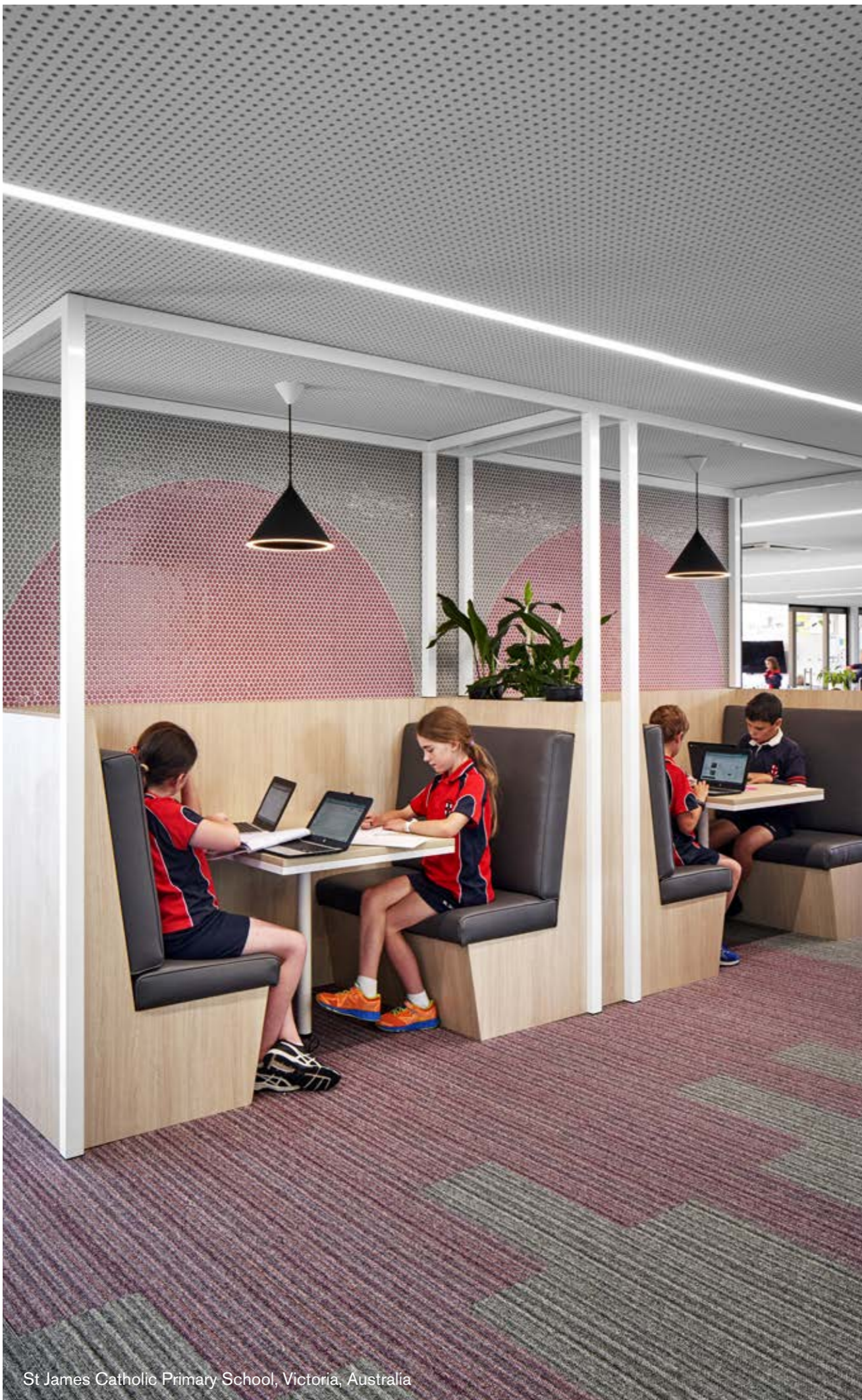
St James Catholic Primary School, Victoria, Australia