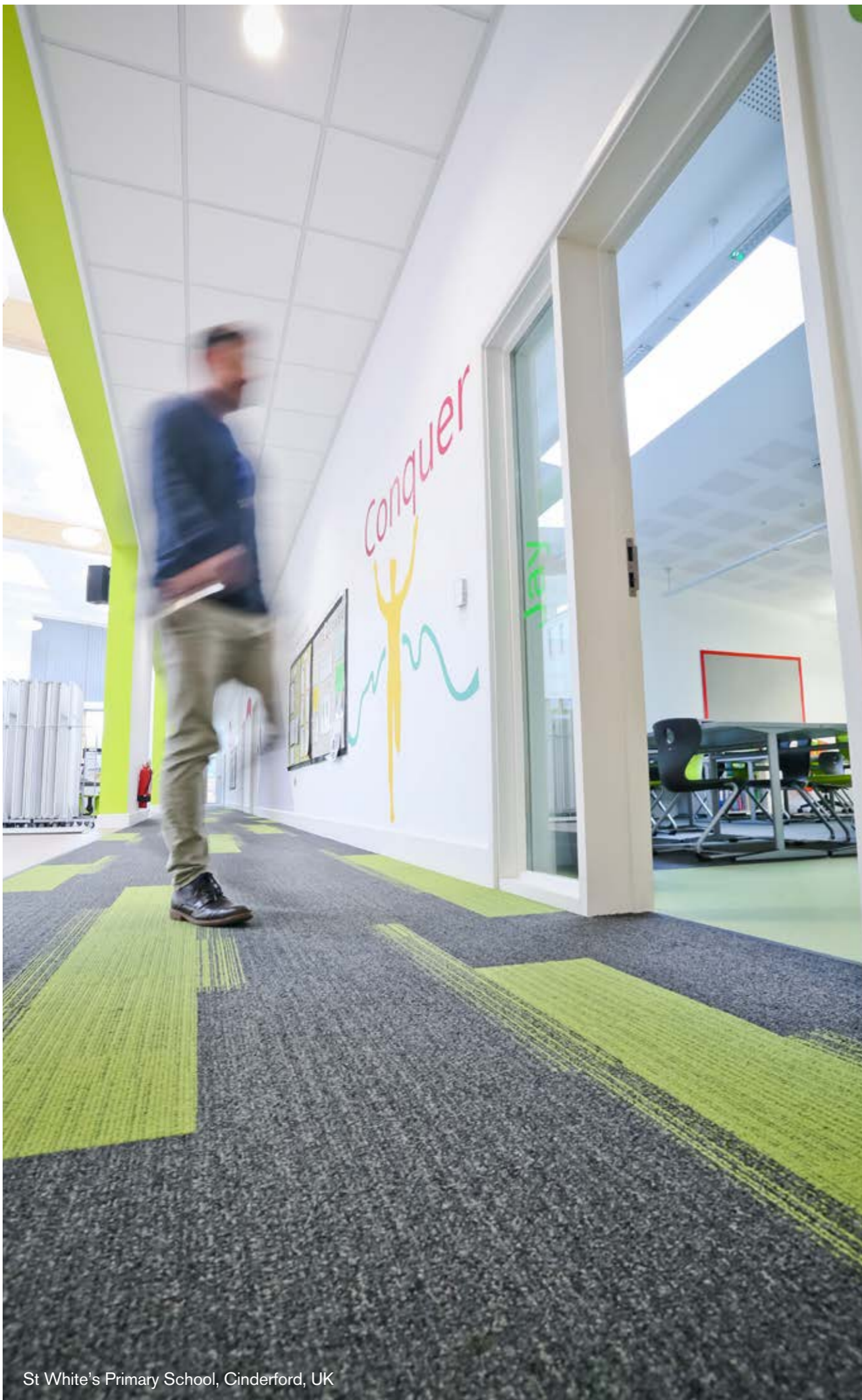
St White's Primary School, Cinderford, UK