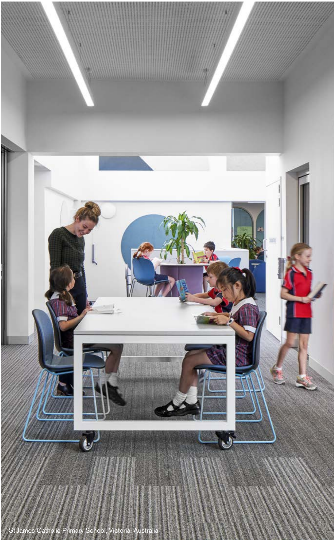
St James Catholic Primary School, Victoria, Australia