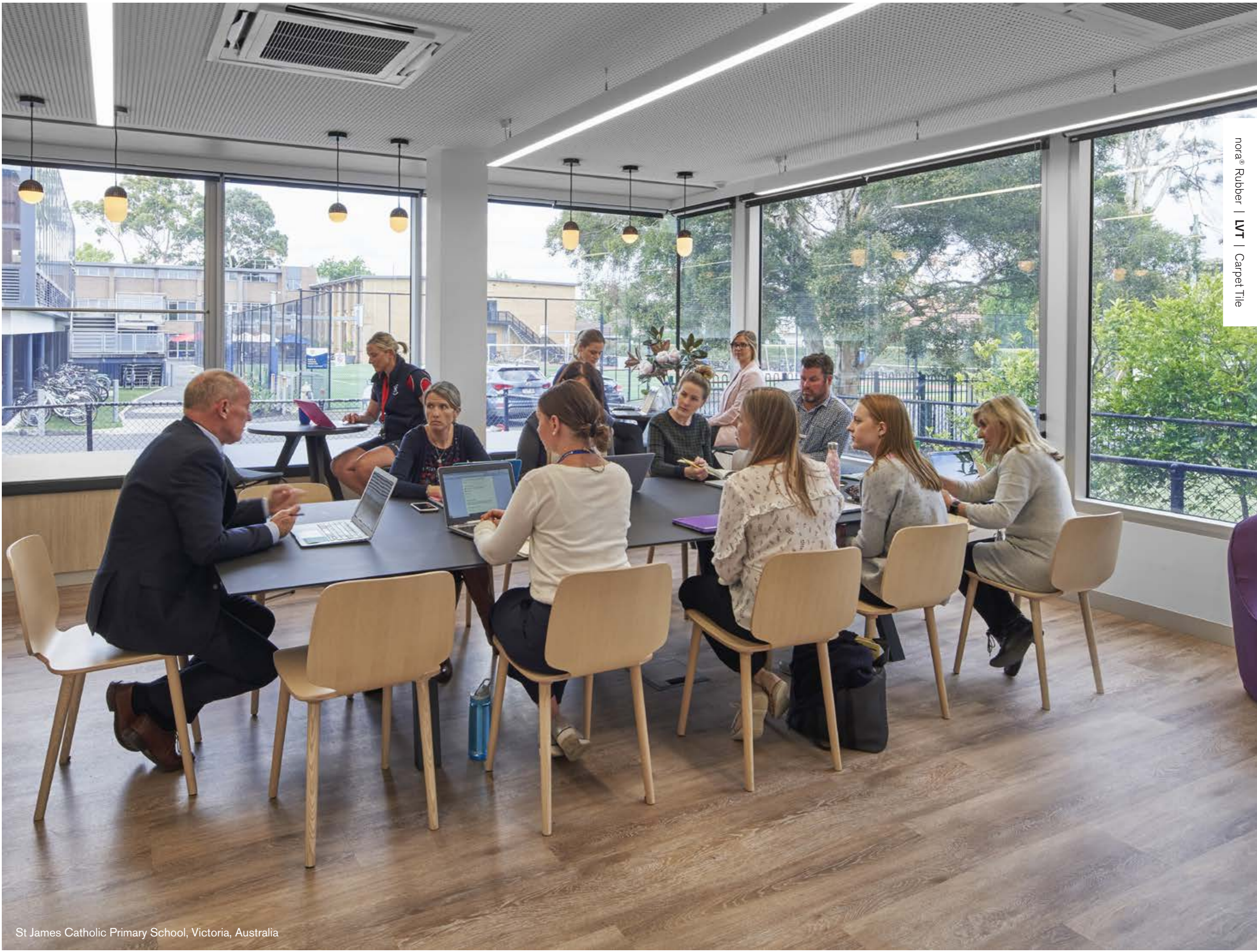
St James Catholic Primary School, Victoria, Australia