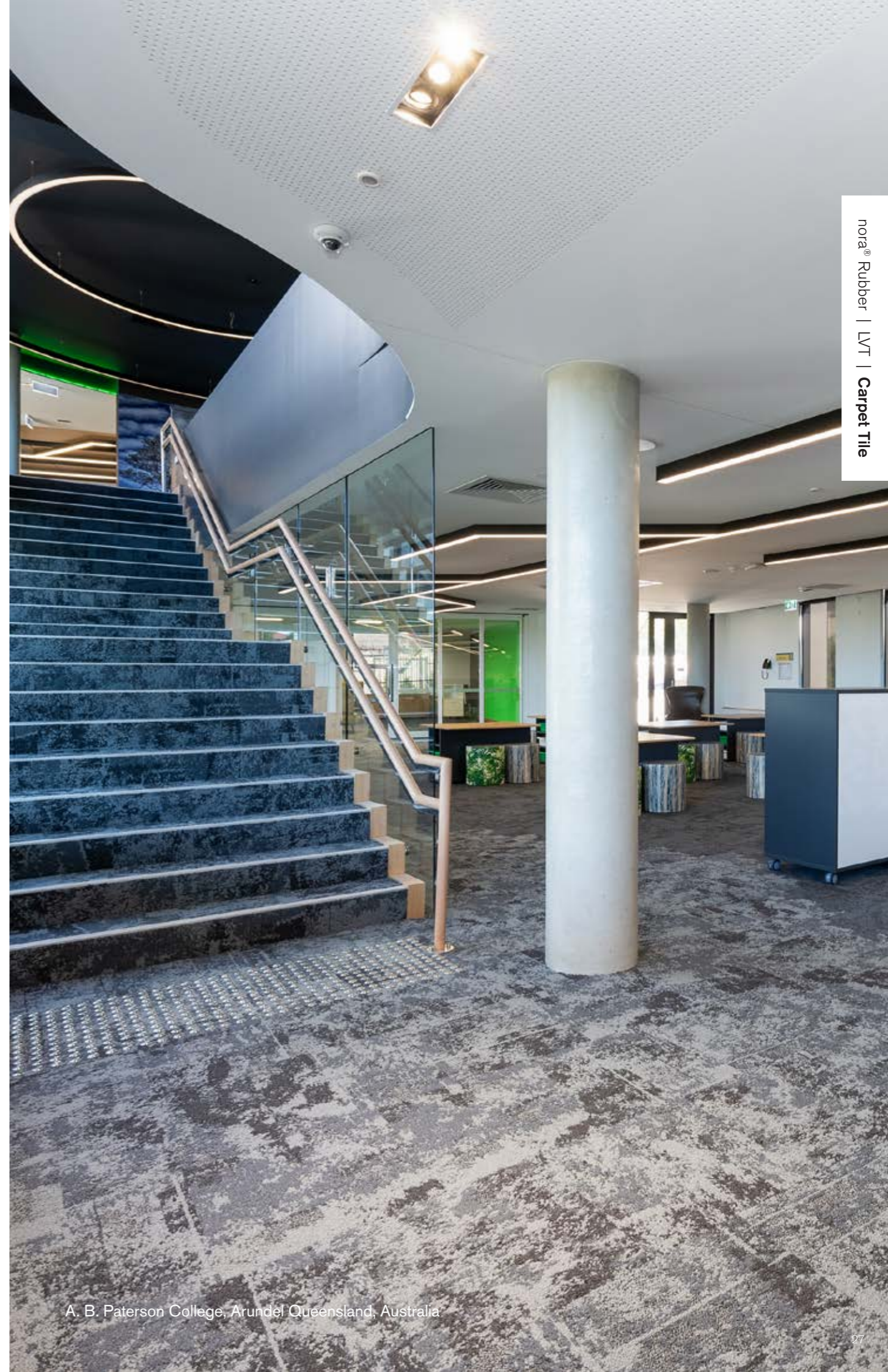
A. B. Paterson College, Arundel Queensland, Australia