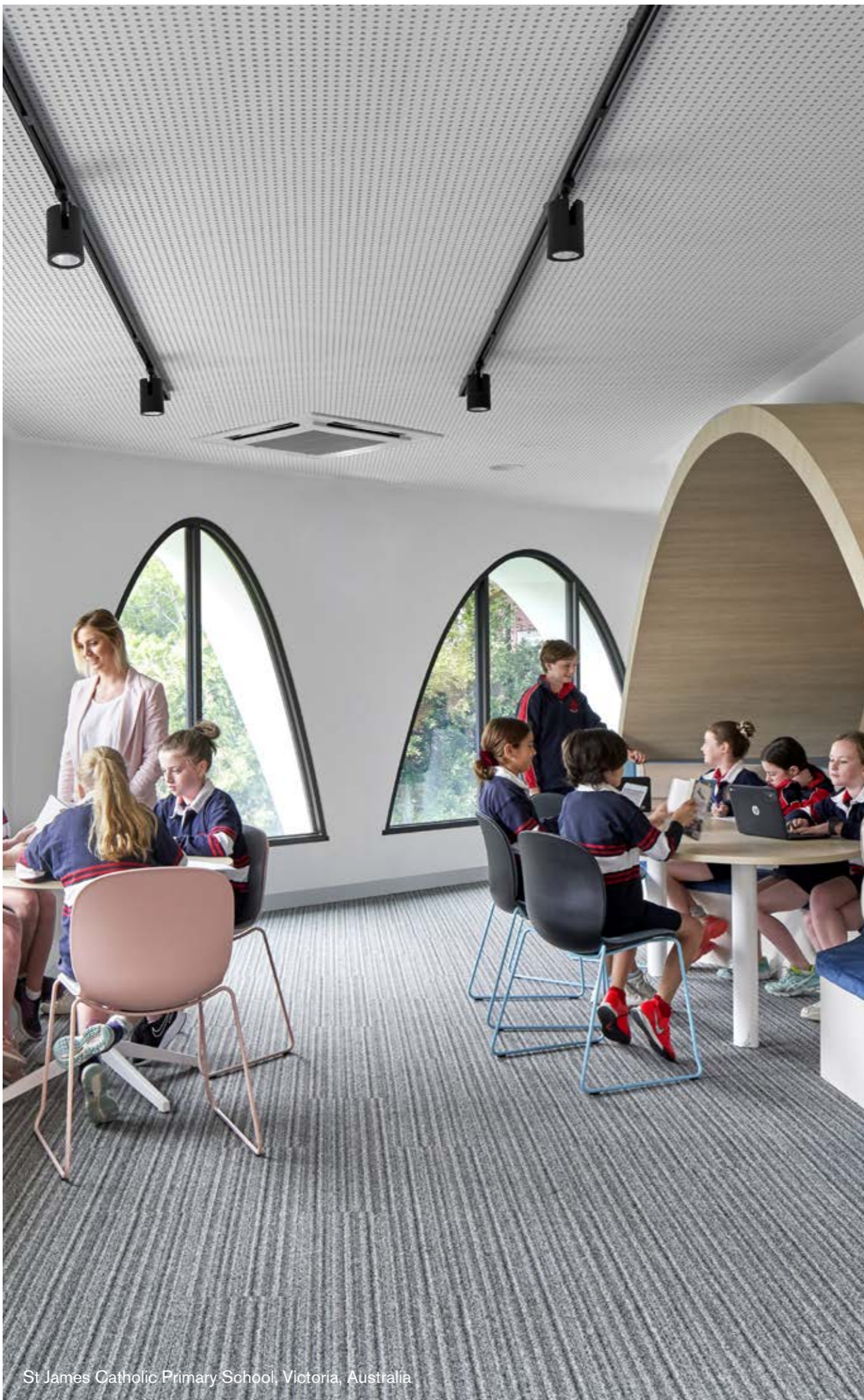
St James Catholic Primary School, Victoria, Australia

Evaluating the best flooring solution for your space doesn't have to be difficult. Our integrated system of carpet tile, LVT and nora® rubber offers the best of hard and soft surfaces working together as a system to create the space you need for your community to thrive.