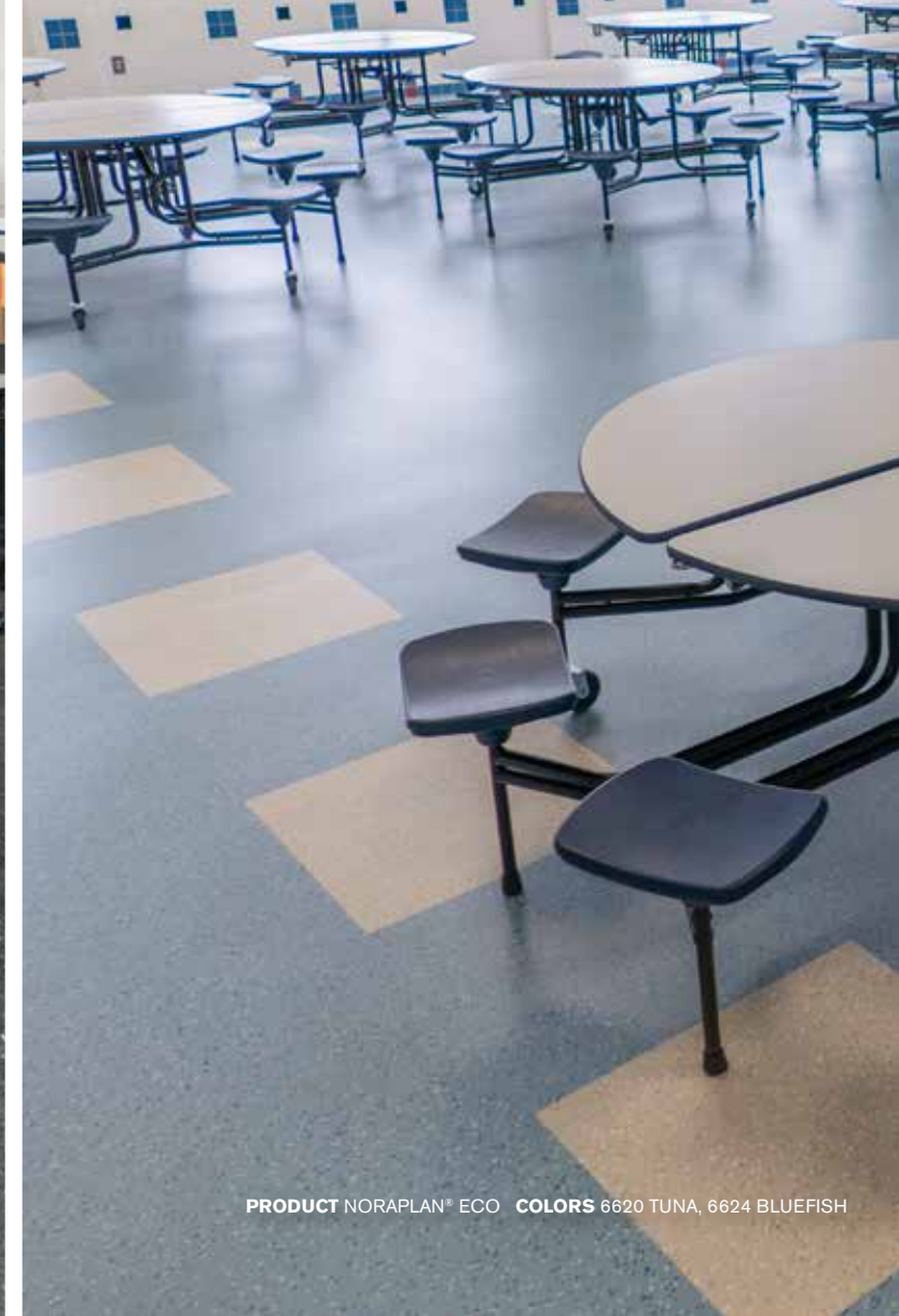
PRODUCT NORAPLAN® ECO COLORS 6620 TUNA, 6624 BLUEFISH