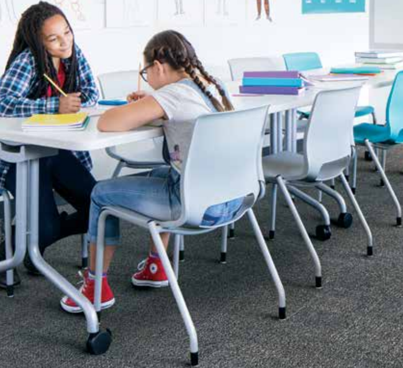
PRODUCT PROFILE™ COLOR 106086 LOFTY