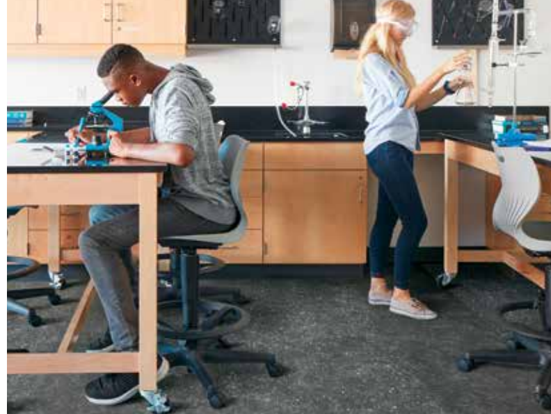
PRODUCT WALK OF LIFE™ COLOR A01204 CARBON PRODUCT WALK THE AISLE™ COLOR A01304 CARBON