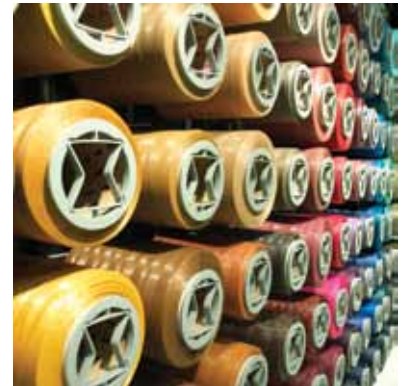
We offer styles available in a full spectrum of stunning colors never thought possible in post-consumer content carpet.