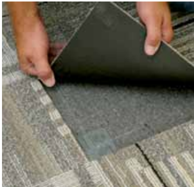
TacTiles create efficient, durable installations, while emitting virtually no VOCs so you have more flexibility.

No Glue Installation. Our revolutionary TacTiles installation system eliminates the need for glue, adhering tiles securely together to form a floor that “floats” for greater flexibility, easier replacement and long-term performance. With more than 20 million square yards installed, TacTiles connectors have proven to create less mess, less waste and offer greater savings, not to mention an environmental footprint that is over 90% lower than that of traditional glue adhesives.