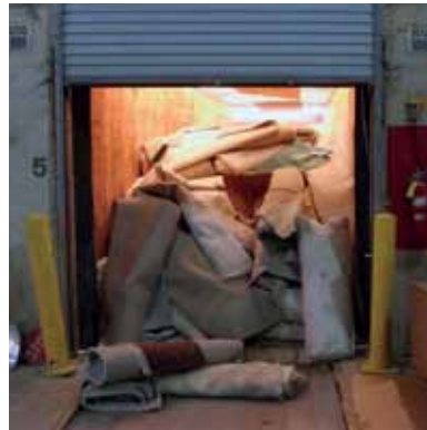
We've reclaimed more than 250 million pounds of carpet since 1995.

The result? Products designed and manufactured with a full color spectrum of post-consumer content fiber and our post-consumer content backing - GlasBacRE. Styles with our 100% recycled content Type 6 nylon feature up to 81% total recycled content, including as much as 29% post-consumer, dramatically reducing our use of virgin resources and moving us closer every day to a closed loop system.